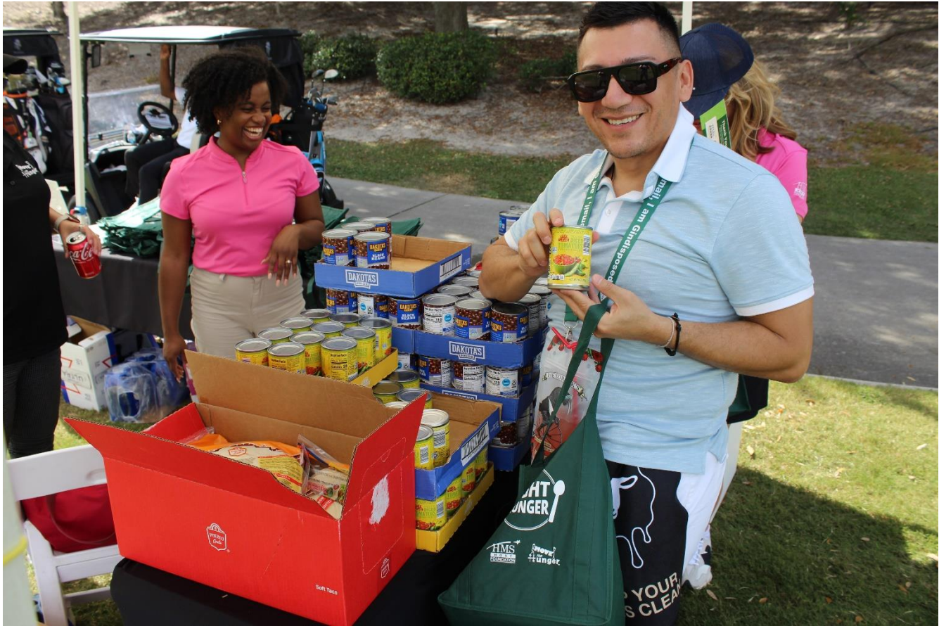
Golfers and volunteers packed 350 Meal Kits for families of four to help combat food insecurity in Central Florida.